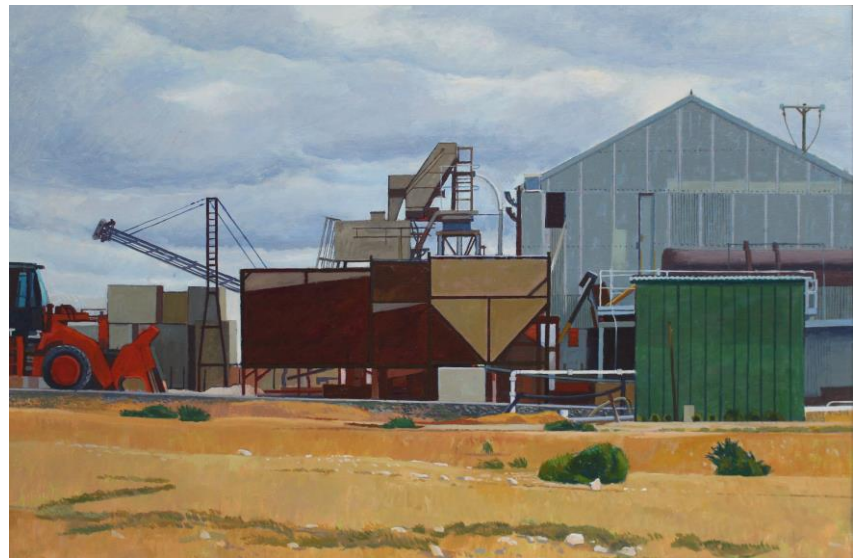
Buildings salt works near Langhorne Creek 2020

AIARTS GALLERY 28 Neate Avenue Belair 5052