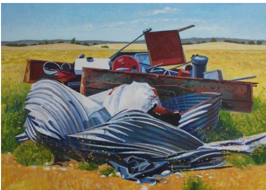
Iron at Coffin Bay SA 2021