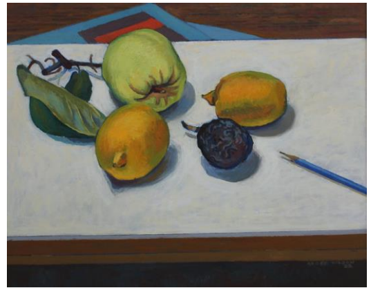
Conversations with a quince 2022