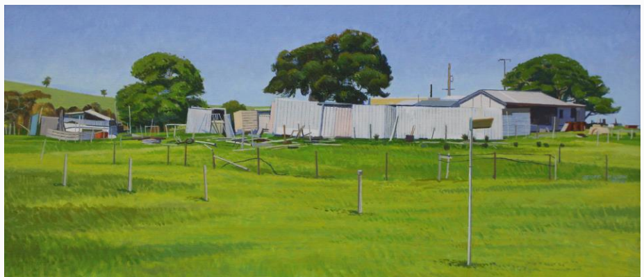
Farm with a white fence 2020