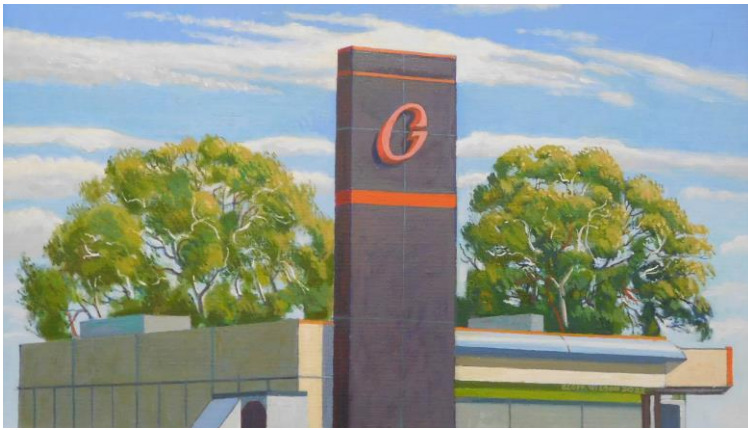
G is for Gums lit by Belair's afternoon sun 2022