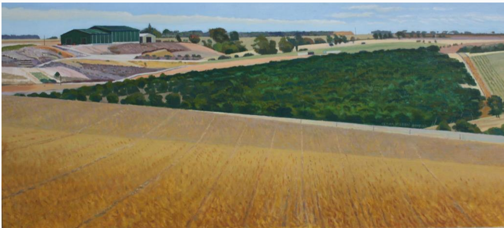
The big wedge of scrub - McLaren Vale south 2022