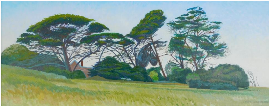
Pine trees Hindmarsh Island 2020